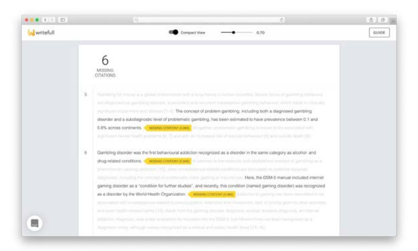
Writefull Cite showing Writefull's citation suggestions in-line and the total count at the top

You can find a detailed explanation of how to use Writefull Cite in our dedicated guide, which can be accessed by clicking on the 'GUIDE' button on the right-hand side of the Cite homepage.